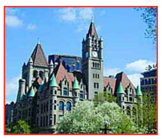
Landmark Center Located in downtown Saint Paul.

The 7th International Aerosol Conference will be held in St. Paul. Minn. between September 10 to 15, 2006. AAAR (www.aaar.org) will be sponsoring and hosting the Conference on behalf of the International Aerosol Research Assembly (www.iara.org). Planning for the Conference is in full swing by members of the Advisory, Organizational, and Technical Program Committees who come from AAAR, and several member nations of the IARA. The Technical Program Committee, consisting of 36 members, will soon start discussions about a Conference Technical Program that will highlight the broad spectrum of fundamentals and application areas of aerosol science and engineering. There will be tutorials on topical areas presented by noted scientists, plenary lectures, special symposia, and poster and platform sessions.