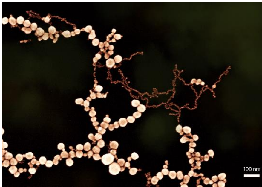
2 nd Place: A Cherry Blossom of Gold Namsoon Eom Lund University